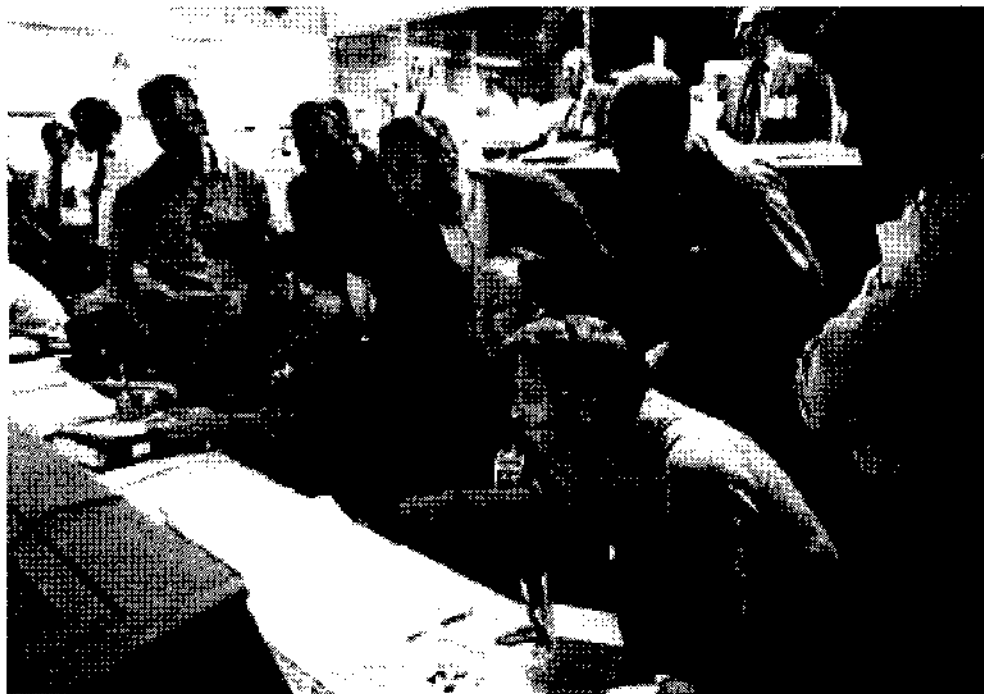
Mission Control Center during the Apollo 13 oxygen cell failure